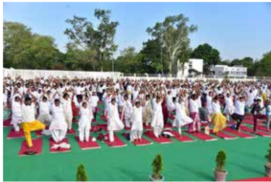
• New Delhi, May 27

More than 7,000 Yoga Enthusiasts Practiced Yoga