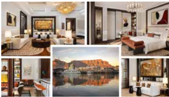
South Africa, joining a collection of 90 distinctive properties worldwide.

As of 1st May 2024, after nine months of renovations, Cape Grace, A Fairmont Managed Hotel unveils its design transformation, reopening its doors once again with a new look inspired by South Africa's heritage, culture and artistry. Located on the iconic V&A Waterfront, Cape Town's most treasured hotel has been gracefully redesigned by globally renowned interior and architecture firm, 1508 London who have paid homage to Cape Town's evolution from a bustling trading port to a cosmopolitan hub. Following this grand transformation, Cape Grace will embark on a new chapter as it becomes the inaugural Fairmont Hotel in