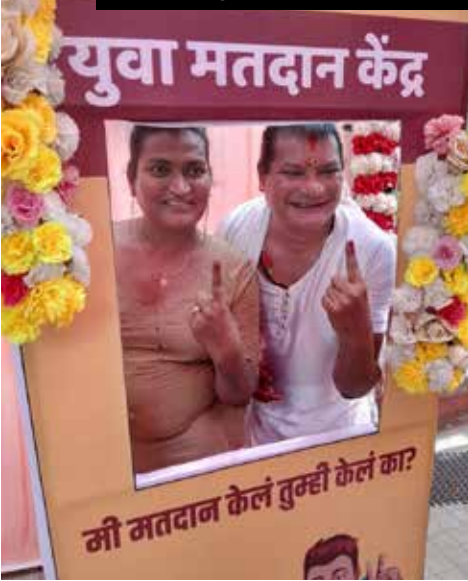
Voters during the 5th Phase of General Elections-2024

Steeped in history, The Oberoi Grand (Continued on page 7)